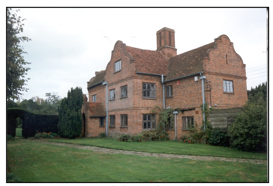
Brook Place, Bagshot, Grade II*