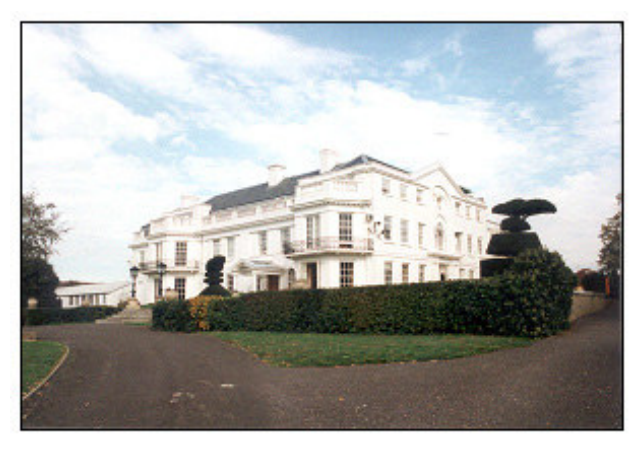
Frimley Park Mansion, Frimley, Grade II

The listing of a building does not necessarily mean that it must be preserved as a museum piece without any form of alteration or extension to suit modern day requirements. However, it is essential that listed building consent has been obtained from the Borough Council before any work which affects the character of the building is carried out. No fees are required. Failure to obtain such consent prior to carrying out works is a criminal offence which carries penalties of a fine or imprisonment, or both. Application forms for listed building consent and further guidance are available from Surrey Heath Borough Council or the Council's website (details on the back page).