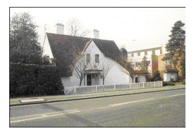
Witwood, Park Street, Camberley, Grade II

The Borough also maintains a list of 'locally listed buildings' which have local architectural or historic significance. There are currently 198 locally listed buildings in Surrey Heath. They contribute greatly to the local character of the Borough and should be protected and retained whenever possible. 'Curtilage' buildings are not included in the listing. Works to locally listed buildings require only the normal planning permission. In considering such applications however, special regard will be given to retaining the character and appearance of the building.