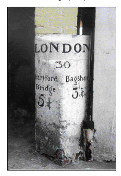
Milestone, London Road, Camberley, Local List

unusual construction methods or their value as part of an attractive group. As a rough rule of thumb, the older the building and the less it has been altered, the more likely it is to be listed. They can be large or small, grand or humble and can also include structures such as milestones, monuments, telephone boxes and village pumps.