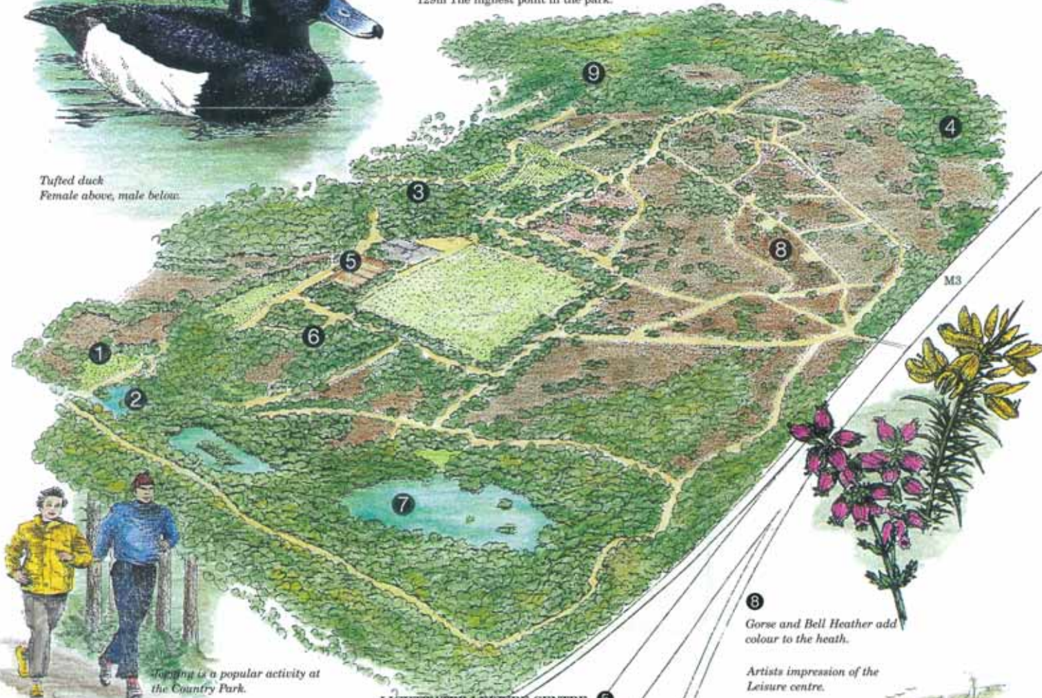
Walking is a popular activity at the Country Park.