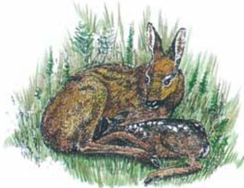
4 Roe Deer can be seen at the Country Park.

The area of heathland within the Country Park has been designated a Site of Special Scientific Interest: an area of high nature conservation value. This is due to the rarity of this type of habitat and the species it supports. This designation legally protects this valuable habitat against damaging operations or development.