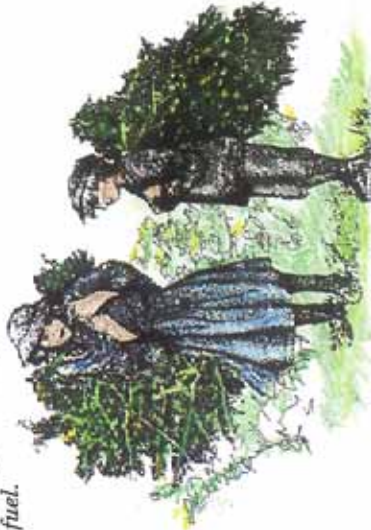
Children gathered gorse for fuel.

In these times the heaths were regarded by travellers as barren and possibly dangerous wildernesses to be traversed as rapidly as possible. The main use of Heathland in the Lightwater area was for sheep grazing, a source of the famed roast mutton, served to the weary traveller in the Bagshot Inns on the London Road.