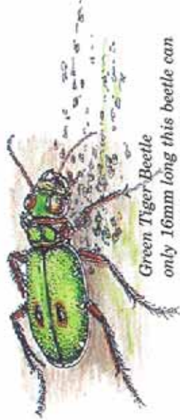
Green Tiger Beetle only 16mm long this beetle can run at 60cm per second.