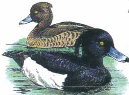
Tufted duck Female above, male below.

A variety of wildfowl can be observed on the ponds, especially on the little lake near the park's entrance. These include Mallards, Canada Geese, Moorhens and some little seen native ducks, such as Tufted Duck.