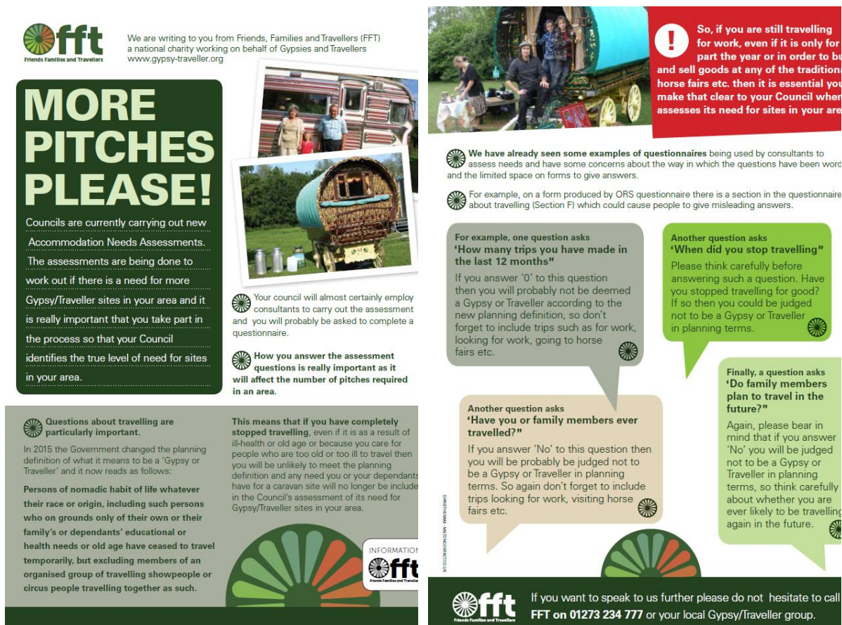
Figure 5 – Friends, Families and Traveller Leaflet